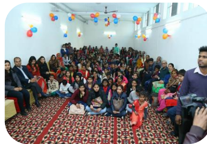
Foundation Day 2018