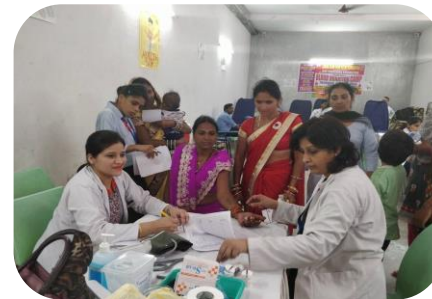
Women Health Day