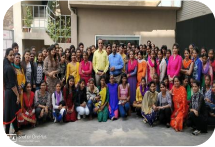
Meeting with JCF Founder