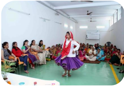
Foundation Day 2016