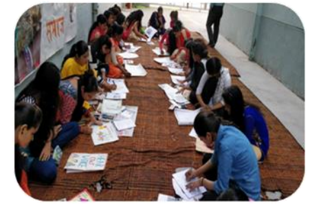
Poster Making Competition