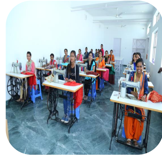
Apparels & Designing