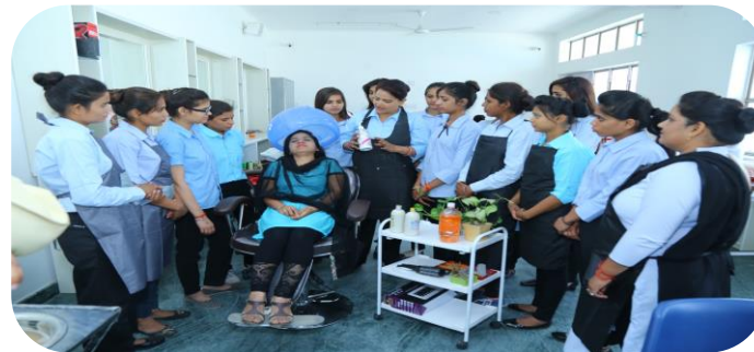
Beauty & Wellness