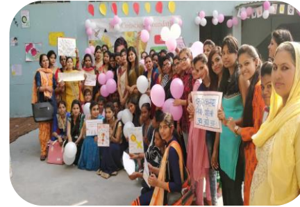
Women's Day Celebration