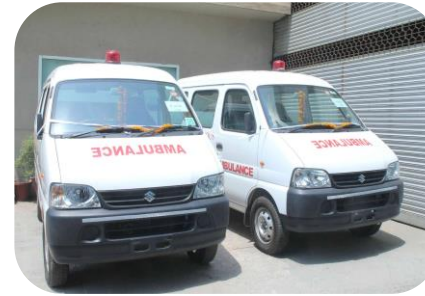
Community Health Service